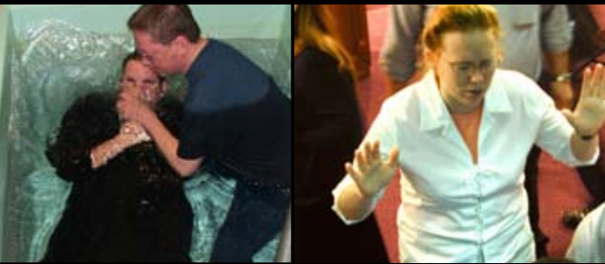
born of the water